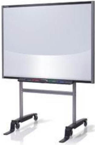
Front Projection on wheels