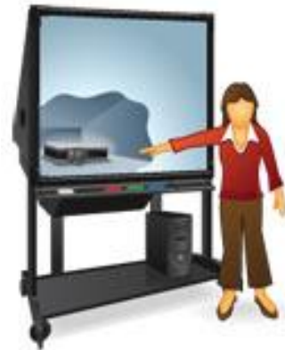
How you would present with a rear projection.