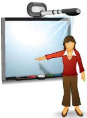
How you would present with a front projection.