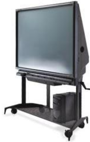
Rear Projection, like in CSU Library.